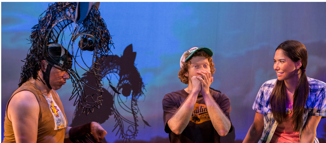
Mistatim (Red Sky Performance)